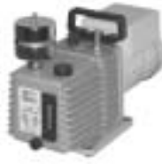
8890A (see note 3)